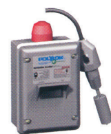
Outdoor SmartFilter® Alarm Polylok, Zabel & Best filters accept the SmartFilter® switch and alarm.