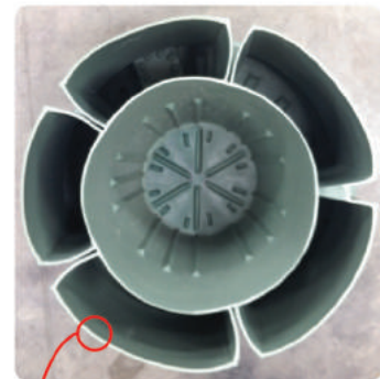
Sectional view of plastic tank internal showing one-piece construction.